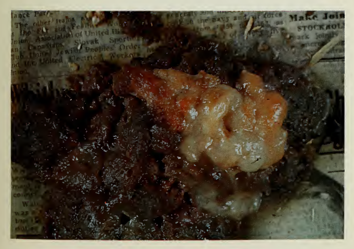
Fig. 6. Virus enteritis — stool sample with typical mucus "slug" on top.