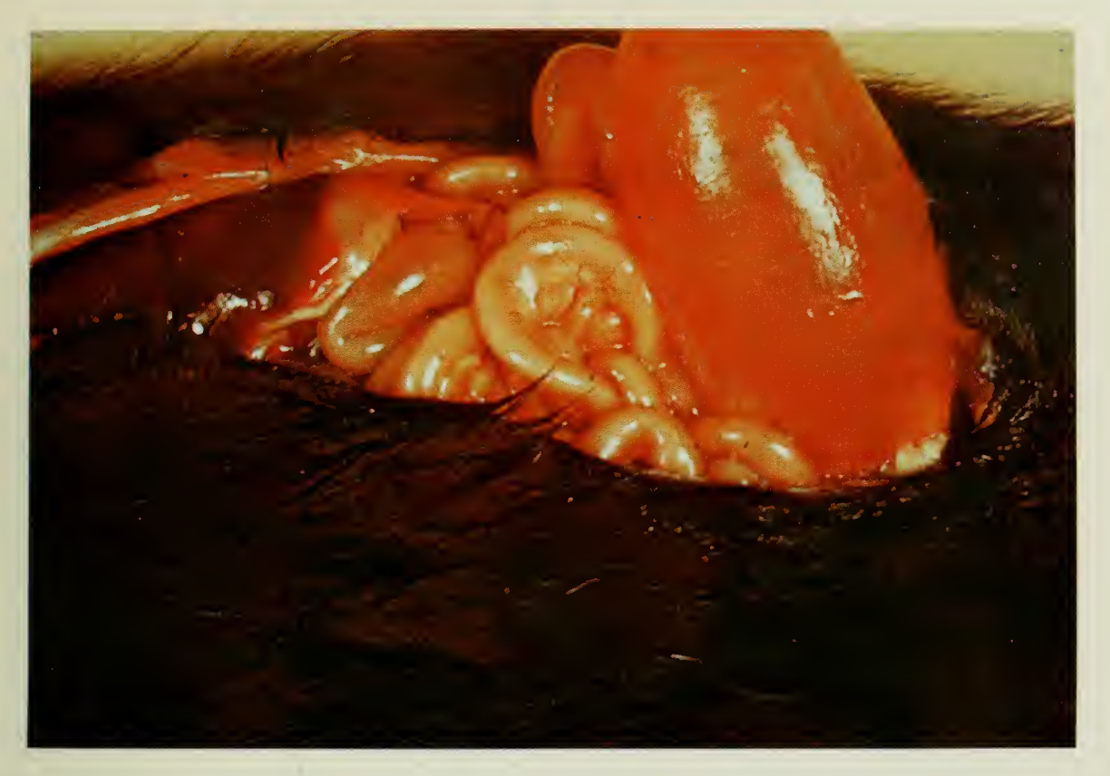
Fig. 1. Plum bladder disease — distended bladder due to calculi blocking urethra.