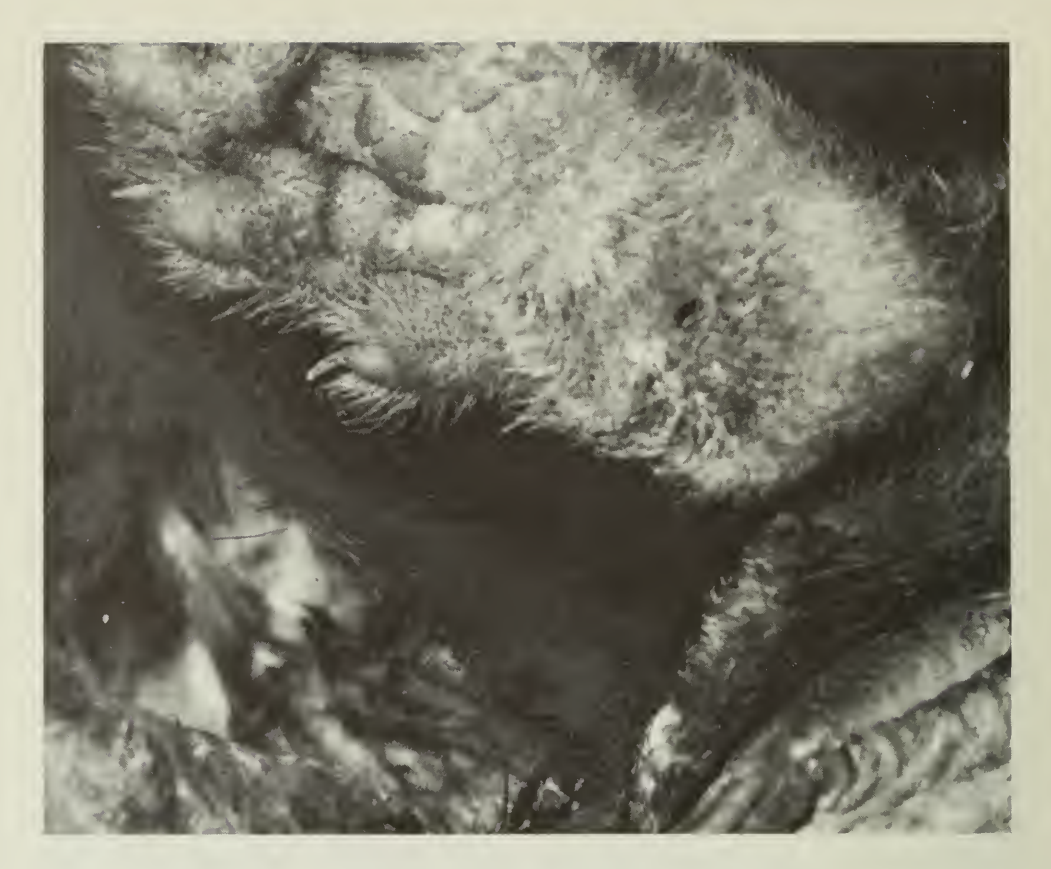
Fig. 5a. Distemper — swelling and encrustation of footpads.

there is a crusty nasal discharge adhering to nostril openings. Sometimes the nose and footpads are swollen and covered with thick, dried crusts (Figures 5 and 5a). Other areas, such as the belly, often show thickening of the skin along with crusting and loss of hair; and the coat is unkempt, dirty and stained by urine and feces.