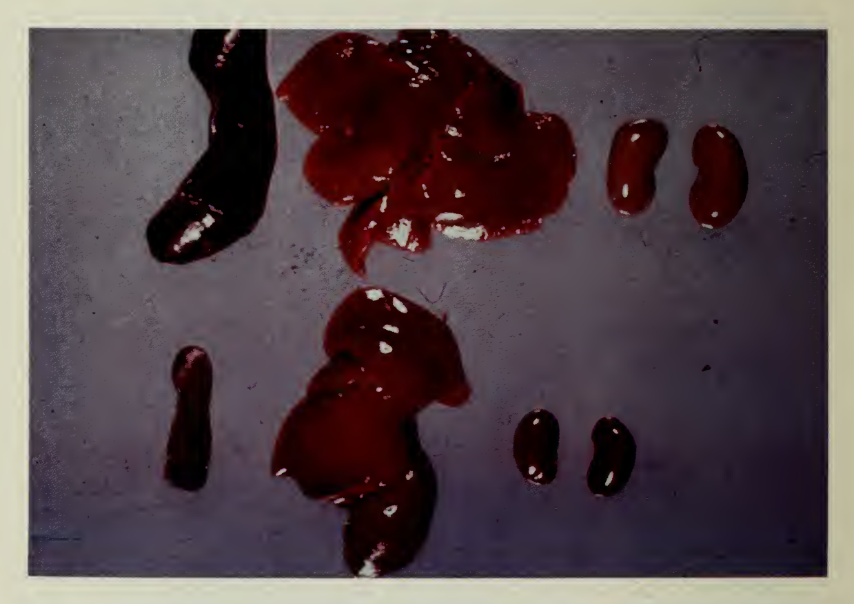
Fig. 4. Aleutian disease - L to R: spleen, liver, kidneys; top, infected; bottom, normal.