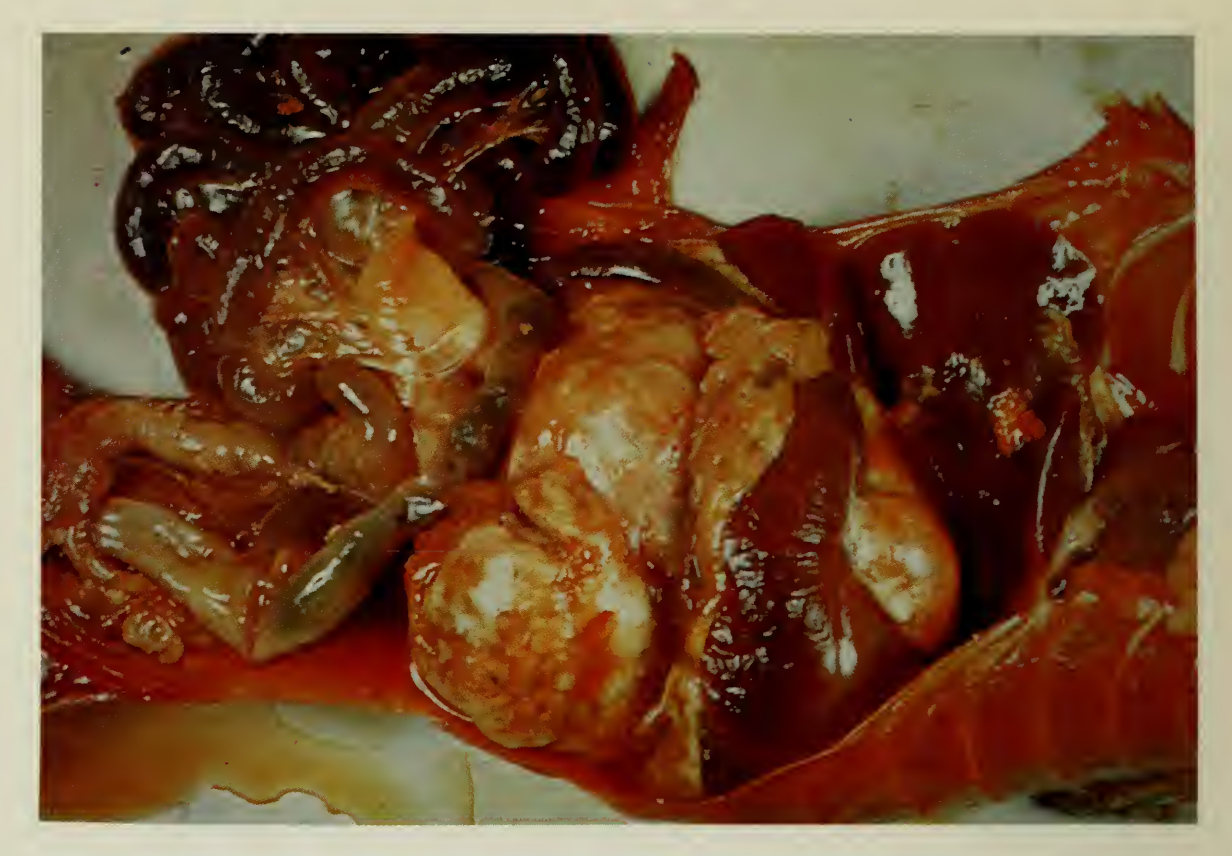
Fig. 3. Tuberculosis – lesions in abdominal organs.