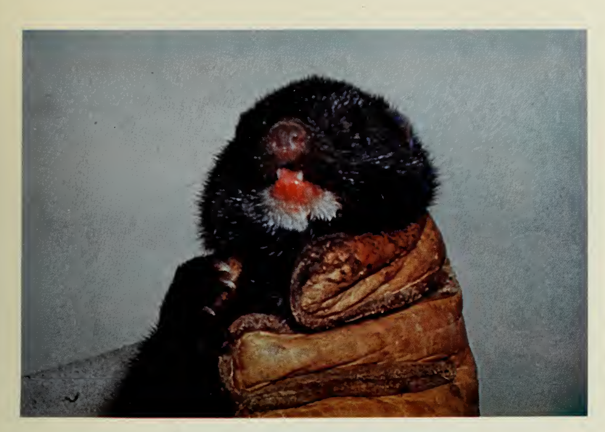
Fig. 5. Distemper — swelling and encrustation of nose.