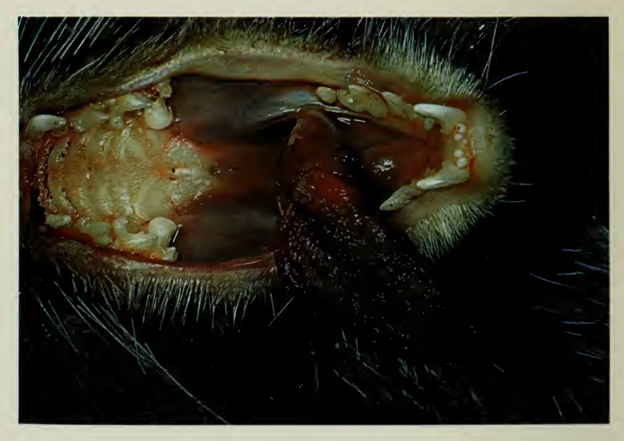
Fig. 8. Strangulation of tongue due to tracheal ring.