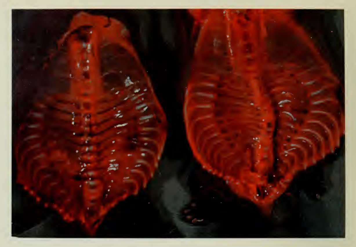
Fig. 7. Rickets in kits — spinal column: L, normal; R, twisted due to rickets.